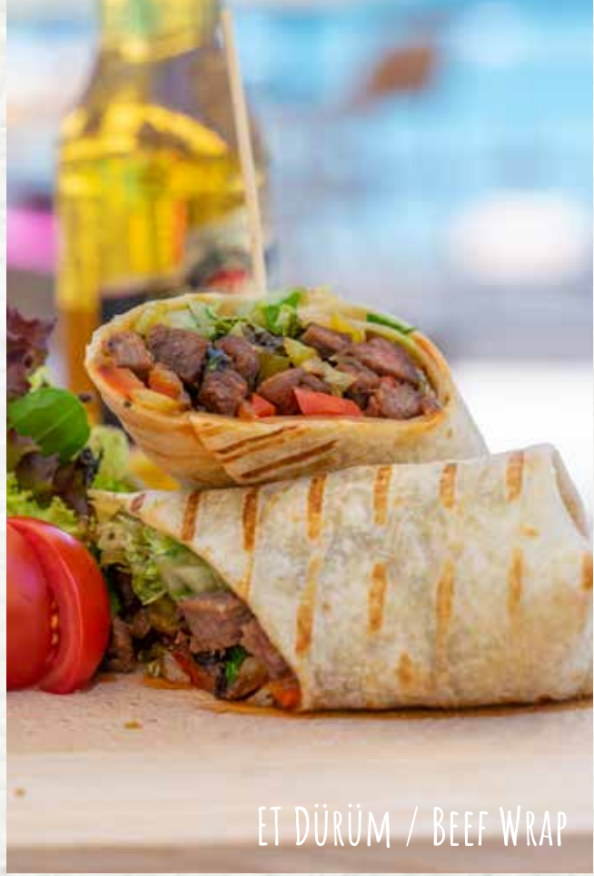
ET DÜRÜM / BEEF WRAP

Et dürüm, soğan, biber ve patates cipsi ile Onion and pepper rolled with grilled beef fillets served with french fries