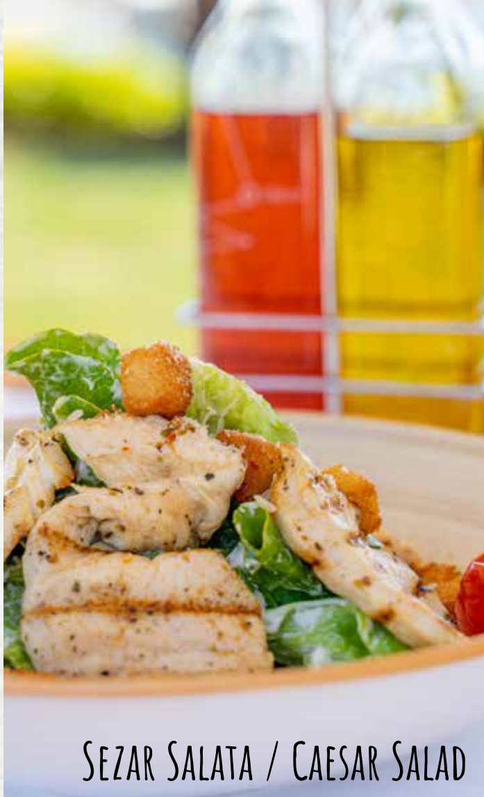
SEZAR SALATA / CAESAR SALAD

Soğan, mısır ve ranch sos eşliğinde With onion, corn, garlic and ranch dressing