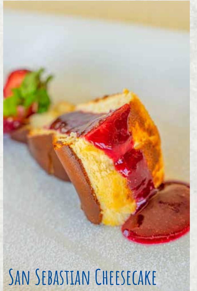
SAN SEBASTIAN CHEESECAKE

Çikolata, vanilya ve çilek Chocolate, vanilla and strawberry ice cream