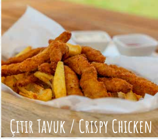
ÇITIR TAVUK / CRISPY CHICKEN