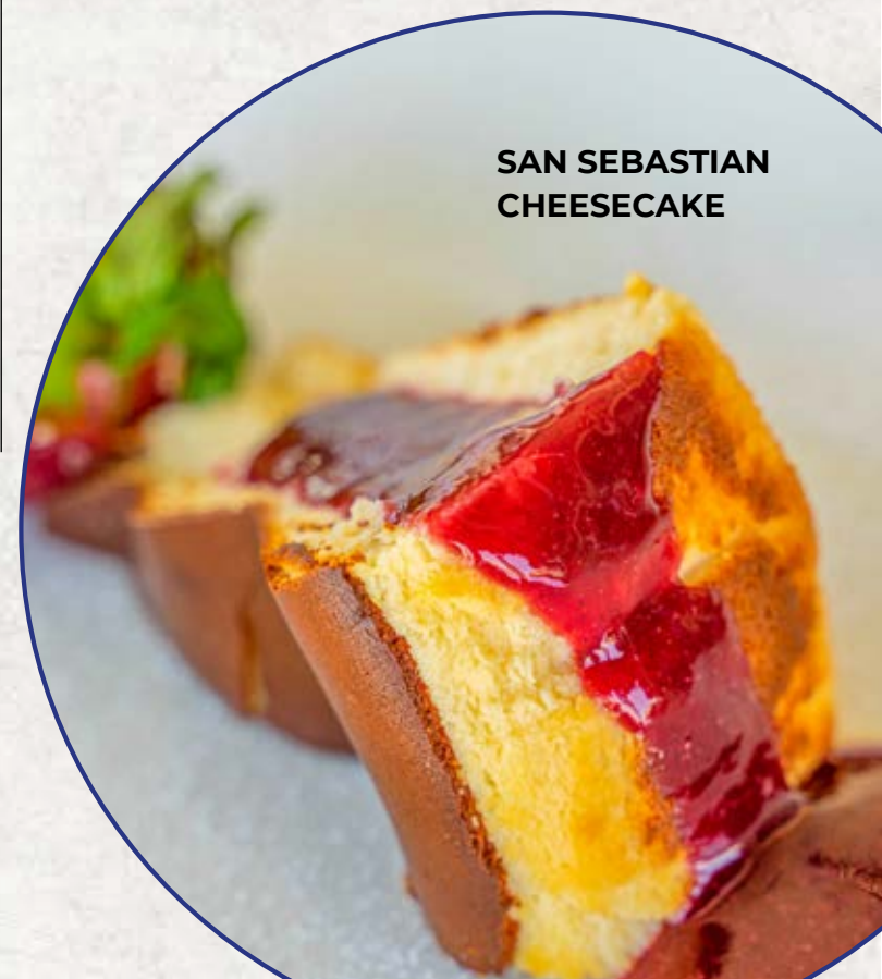
SAN SEBASTIAN CHEESECAKE

BİZİ SOSYAL MEDYADA TAKİP EDİN FOLLOW US ON SOCIAL MEDIA