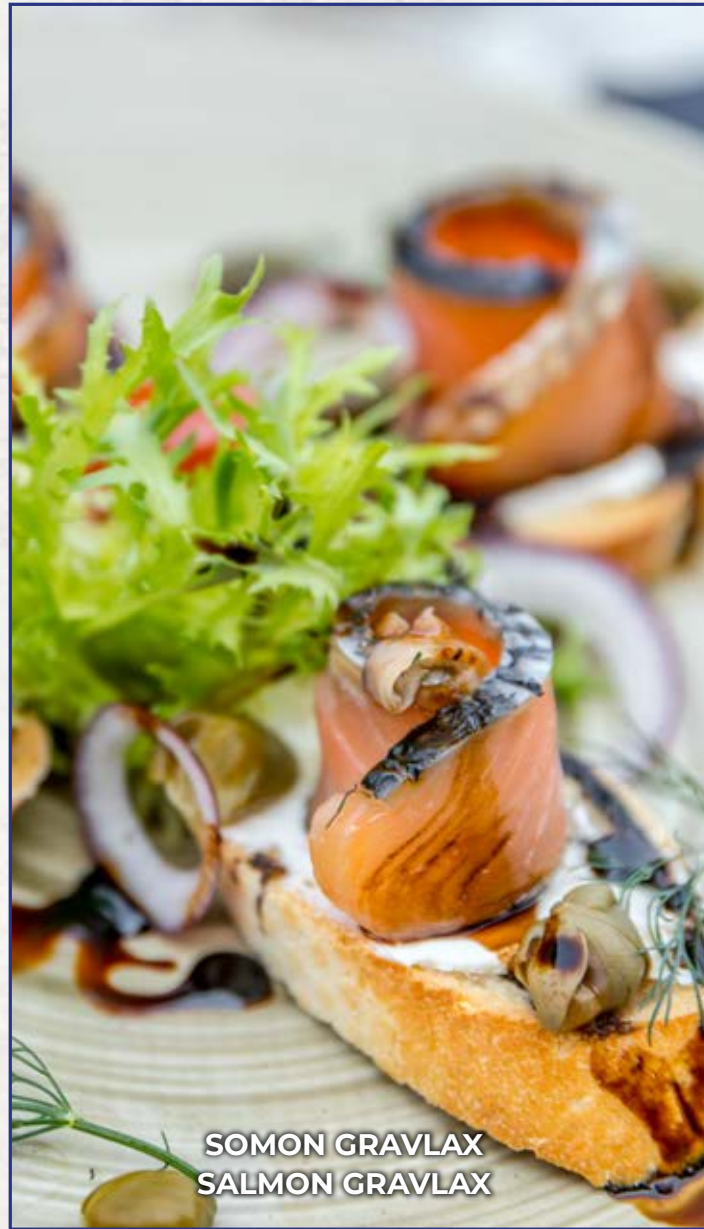
SOMON GRAVLAX SALMON GRAVLAX

Thinly sliced salmon on top of melba toast and cream cheese with dill and balsamic sauce