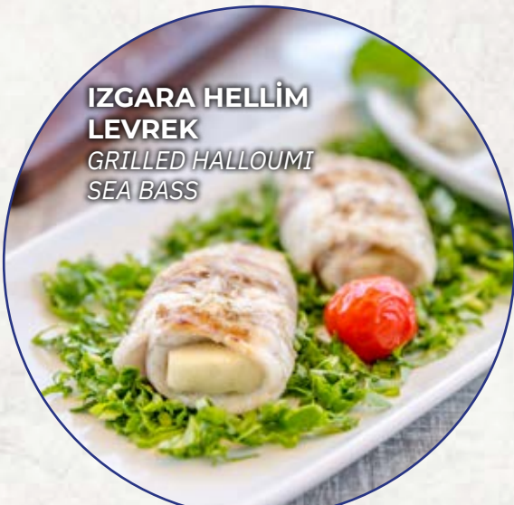
IZGARA HELLİM LEVREK GRILLED HALLOUMI SEA BASS