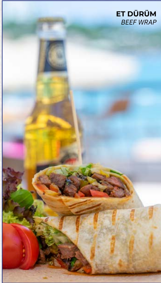
ET DÜRÜM BEEF WRAP

Bonfile parçaları, karamelize soğan, mantar, biber ile 180 gr. fillet slices, caramelised onion, mushroom, grilled pepper. Served with french fries